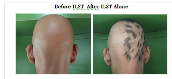
Figure 4 The ILST alone without MD gives uneven hair regrowth like bushes.

With ILST alone the growth was slower, less uniform, like bushes, unevenly distributed, with areas of no grow (Figure 4) (Figure 5).