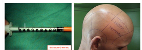
Figure 2 The syringe shows the amount of undiluted ILST between 2 adjacent white arrows, and the scalp shows the area of AA divided into 2" square boxes. 0.02cc (0.8mg) of ILST is given into the center of each square.

This was followed by injection of 0.02cc (0.8mg) of undiluted ILST to an approximately 2 inch square area or AA on the scalp with 30G needle (Figure 2).